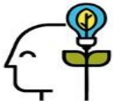
1 - Atria Group - Mission, vision and values